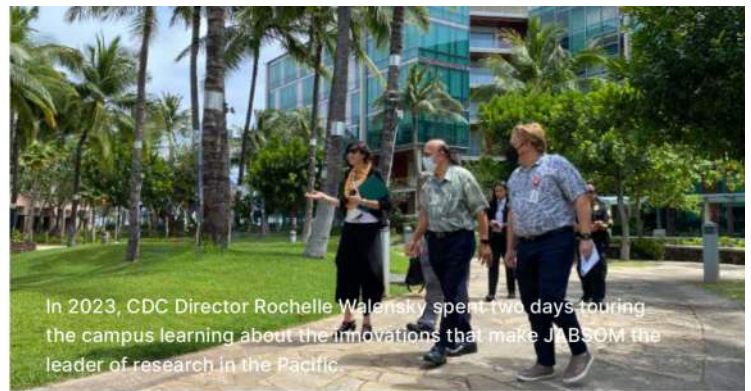
In 2023, CDC Director Rochelle Walensky spent two days touring the campus learning about the innovations that make JABSOM the leader of research in the Pacific.