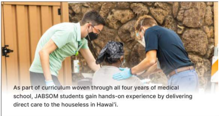
As part of curriculum woven through all four years of medical school, JABSOM students gain hands-on experience by delivering direct care to the houseless in Hawai'i.