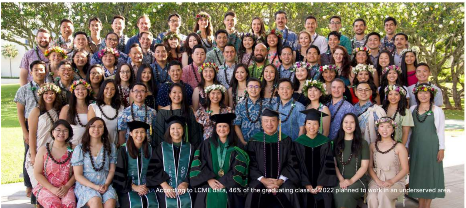
According to LCME data, 46% of the graduating class of 2022 planned to work in an underserved area.