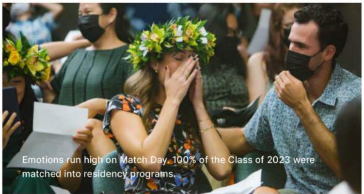
Emotions run high on Match Day, 100% of the Class of 2023 were matched into residency programs.