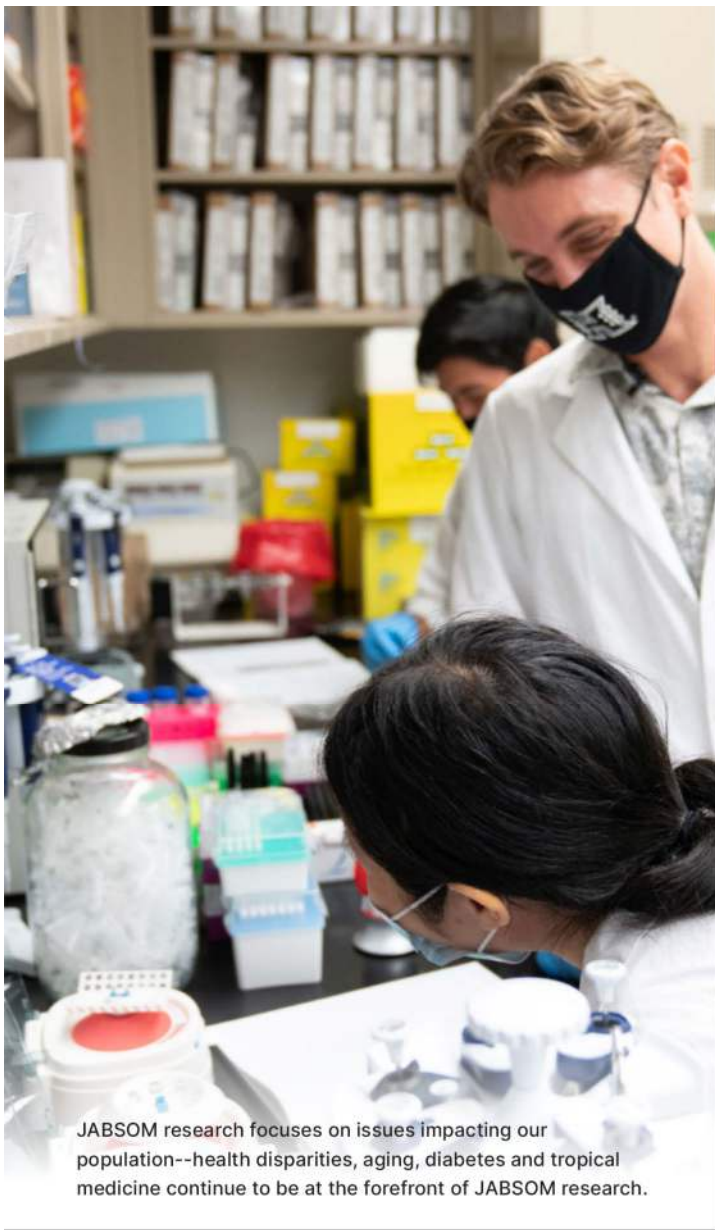
JABSOM research focuses on issues impacting our population--health disparities, aging, diabetes and tropical medicine continue to be at the forefront of JABSOM research.