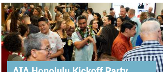
AIA Honolulu Kickoff Party

Select programs to support based on Annual Level (refer to previous page). For example, Ossipoff Sponsor can make up to two selections.