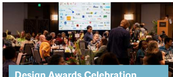
Design Awards Celebration